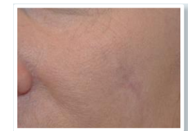
After 7 weeks of NewGel+ treatment