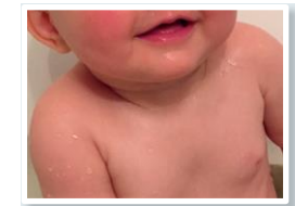
After 4 months of NewGel+ treatment