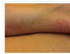
After 4 months of NewGel+ treatment