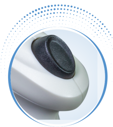
Quick Release Button For easy jaw opening