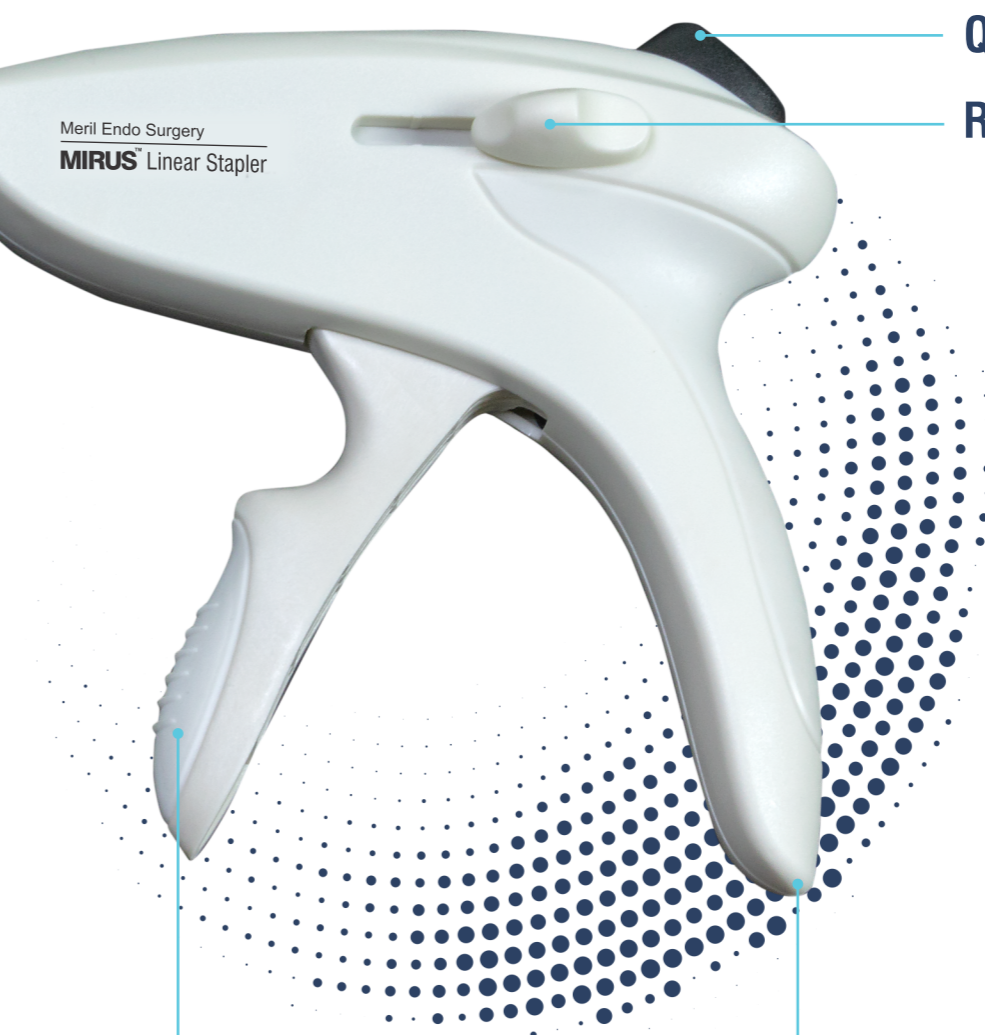
Closing & Firing Handle