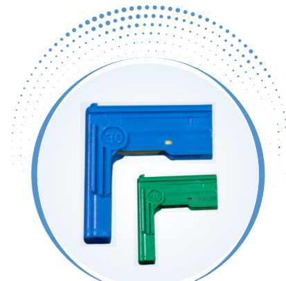
Cartridges For varied tissue thickness