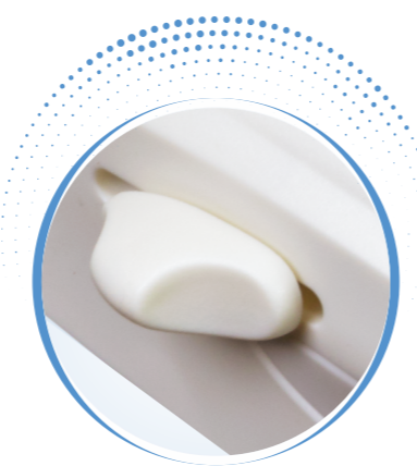
Retaining Pin Knob Advances tissue retaining pin