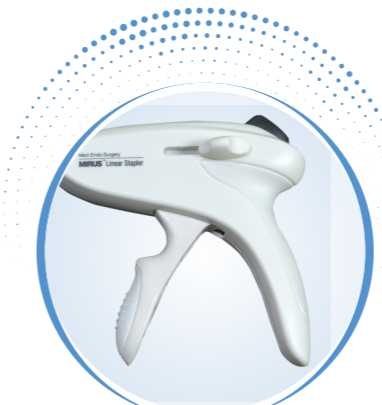
Dual Function Handle For repositioning closure & stapling

The ergonomic design with single handed closing & firing lever facilitates user comfort and control. Staple formation creates the perfect 'B' shape on each and every firing for improved clinical performance.