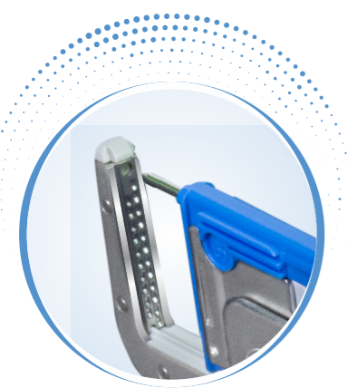
Cutting-Guide For safe & precise transection